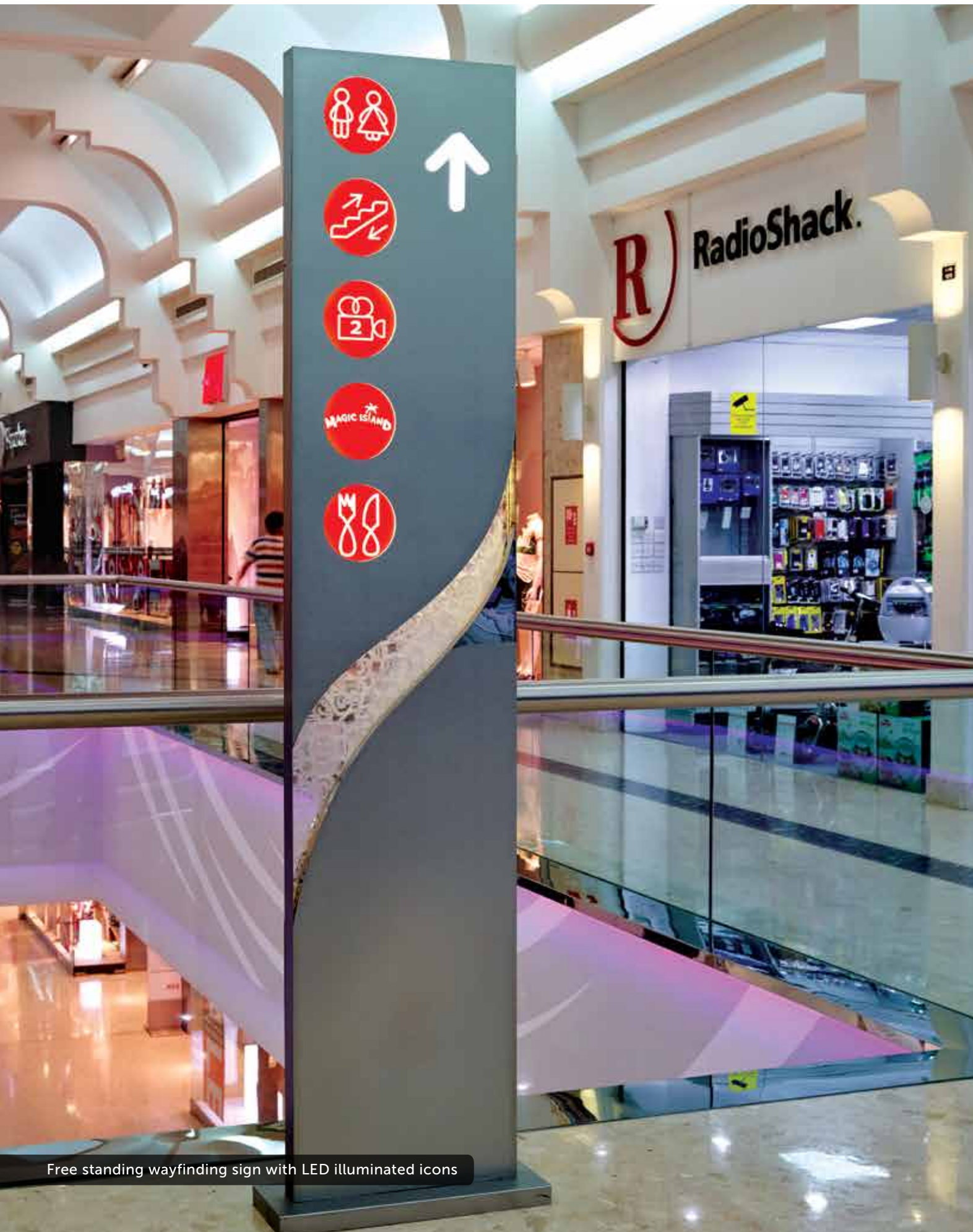
Free standing wayfinding sign with LED illuminated icons