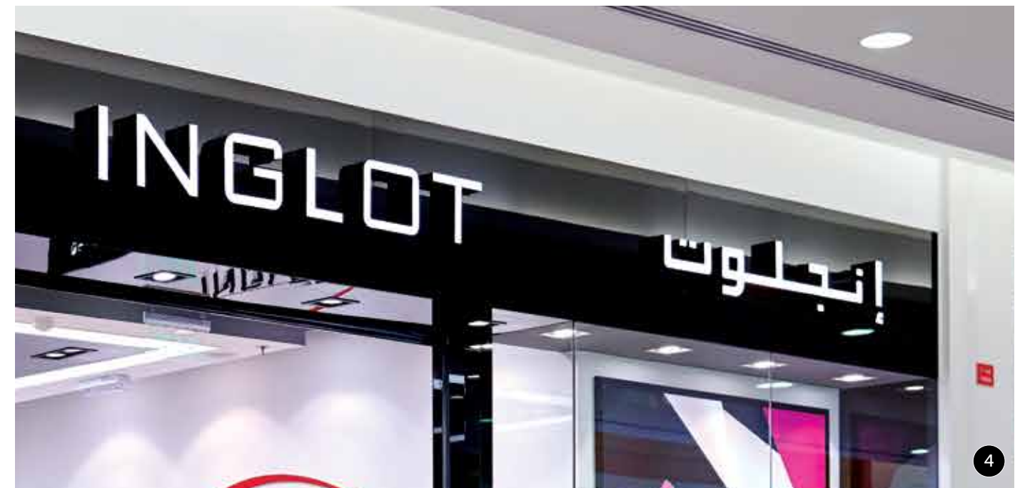
1 Sidelit 3D letters 2 3 4 3D frontlit LED letters