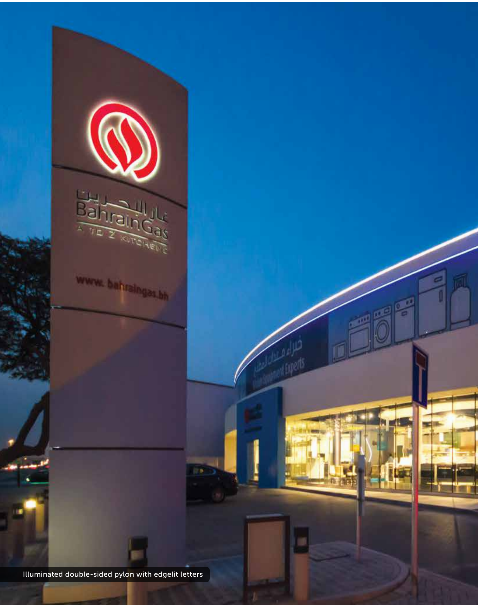
Illuminated double-sided pylon with edgelit letters

To create an organisation that is committed to responsible leadership, ethical and supportive management systems.