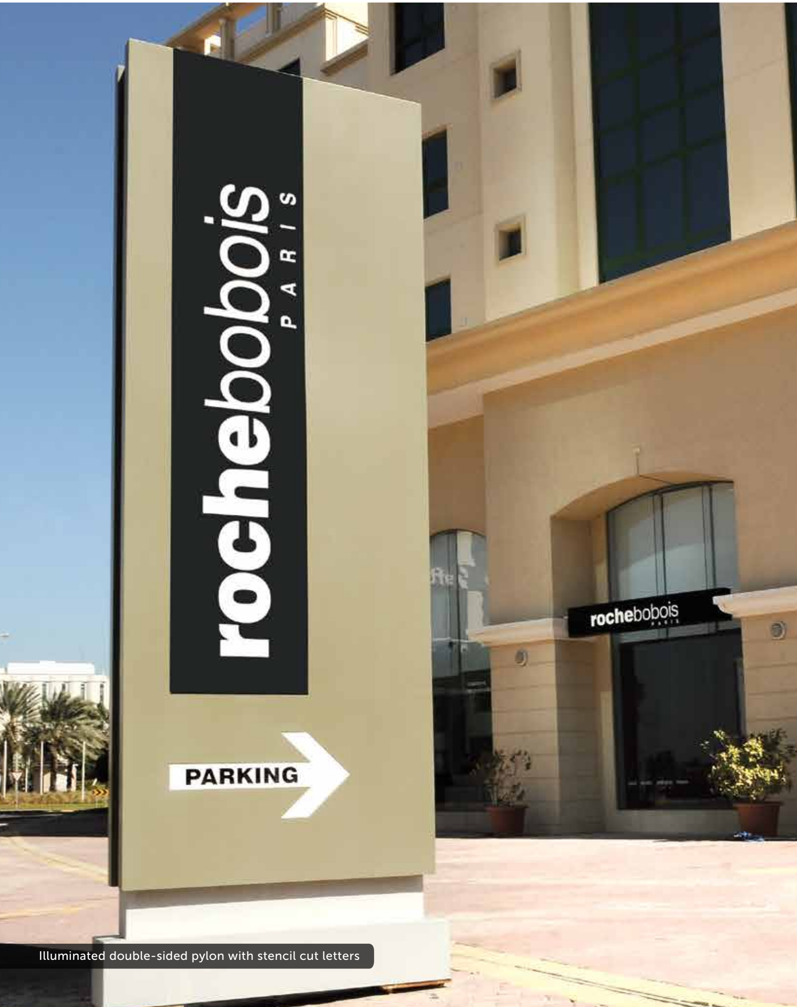
Illuminated double-sided pylon with stencil cut letters