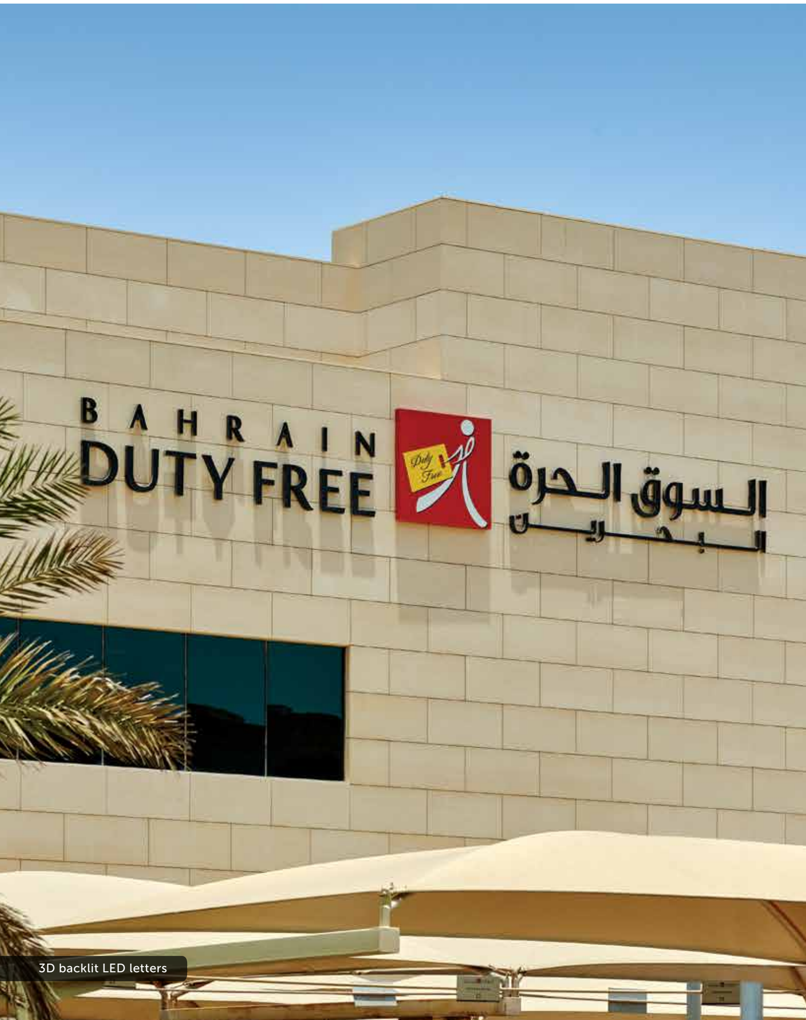
3D backlit LED letters

When it comes to quality, we think beyond the challenge. In the end, we know that our success is measured not only by our ability to think big, but also by our commitment to bring those ideas to life. This way of thinking has been at the heart of our success. It reflects the energy and spirit of a company with a solid foundation.