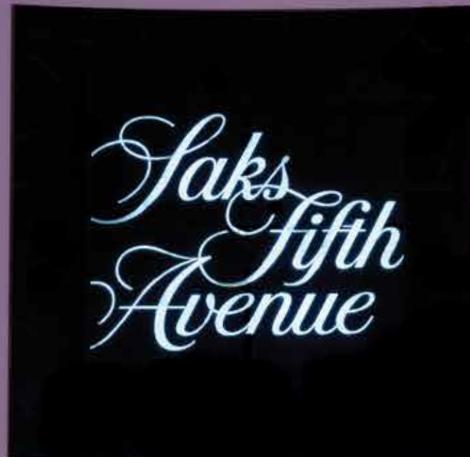
Aluminium panel mounted in glossy silver finish